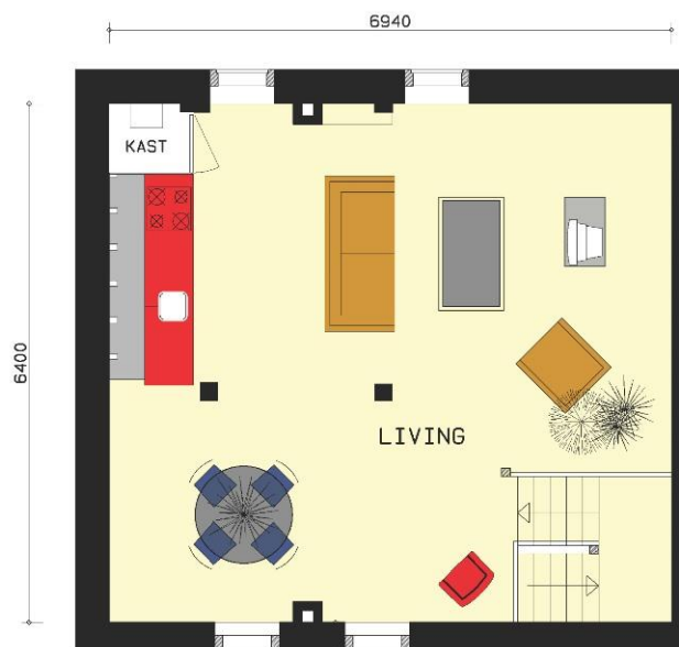
VERDIEPING FIRST FLOOR